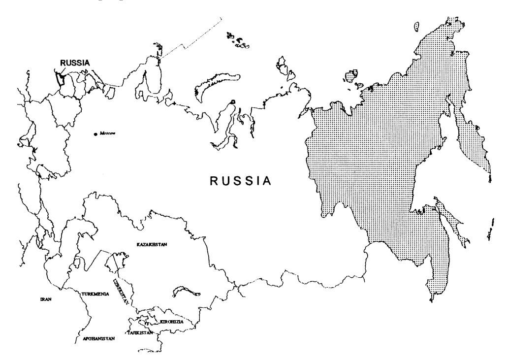
Figure 1. Russian Far East territory compared with the Russian Federation

The Russian Far East (RFE) constitutes one-third of the territory of the Russian Federation (see Figure 1), and it is two-thirds the size of the United States. Geographically, it is adjacent to China, the Korean peninsula, Japan, and the United States (Alaska). This part of the Russian Federation has great potential for economic growth, because of its abundant natural resources and the high level of education of its people.